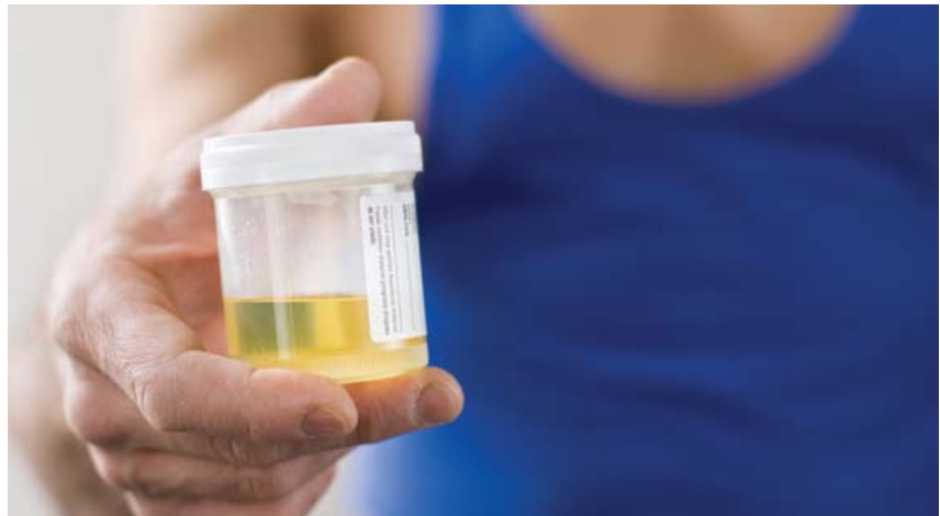
There are no barriers to employers introducing drug testing prior to or during employment.

With no legally binding regulations, guidance or code of practice on intoxicants issued by the HSA, Irish companies who wish to manage the risk of workplace intoxicants may be guided by existing relevant sections contained in the Safety, Health & Welfare at Work Act 2005 and legal precedents from the Irish Labour